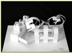
Grand Prix 2008 Moon, Jung-Im , Republic of Korea